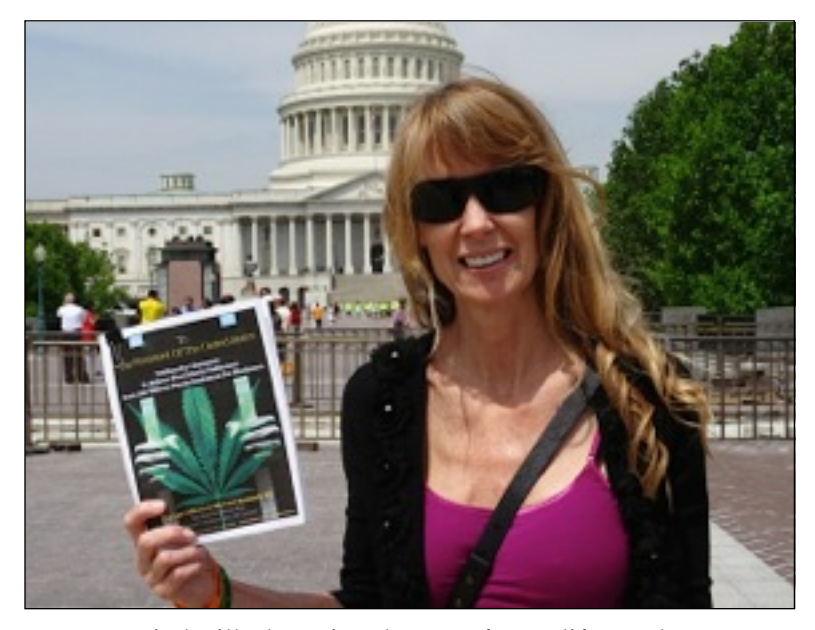
On Capitol Hill advocating clemency for pot lifers and women serving draconian sentences for drug conspiracy cases.

A lot happened this past year, but nothing more earth shattering than "Clemency Project 2014" - announced and initiated by none other than the very office that filled our prisons full of drug offenders - the DOJ is now seeking "justice through clemency." Music to our ears!!!