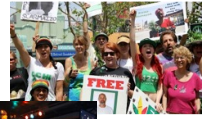
Worldwide Marijuana March